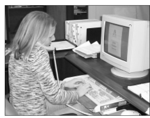
The City's citizen surveyors will enter responses into the computer as they conduct the survey.

The telephone survey will be conducted by individuals hired specifically to do the survey. Planning Department staff, in conjunction with the Office of the City Manager, develops the survey, and provides the training and oversight of the interviewers. Randomly selected telephone numbers of citi-