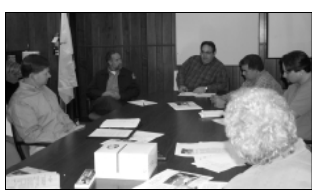
Tree Commission members meet regularly to discuss their projects.

The City of Auburn has a long history of citizen involvement as shown by the many opportunities to become involved in municipal government. One of the most significant citizen-involvement efforts in the last few years has been the creation of Auburn 2020. This important document sets forth the strategic plan that was developed after a year-long citizen participation effort in 1998 that involved over 200 citizens directly on committees and hundreds more through public hearings and surveys. It replaced Auburn 2000 which was developed using a similar process in the early 1980s. From the Auburn 2020 process, "22 Goals for 2020" were established, a list of specific initiatives that citizens expect the City government to accomplish over the next twenty years. Auburn 2020, along with the City's vision and mission statements, sets the foundation for the future of the City of Auburn.