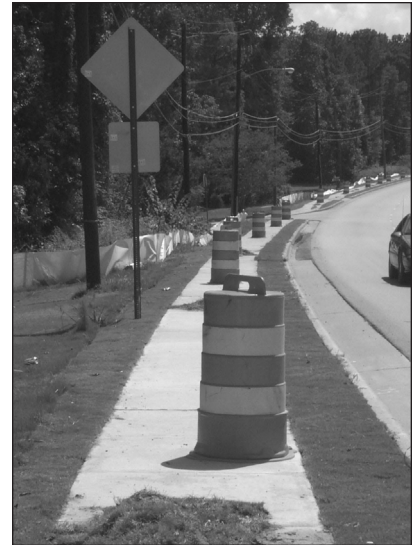
The sidewalk on South College Street is under construction.

late July, and the lowest bidder for the work was D&J Enterprises, Inc. The roads included in this resurfacing project are Bent Creek Road, Cherry Street, Deer Run Road, S. Gay Street (Woodfield to Camellia), Hampton Drive, Thach Avenue (Armstrong to Ross), Waterford Road, Wildwood Drive, Willow Creek Road, Hickory Lane (North Cedar Brook to cul-de-sac), Judd Avenue, and the Middlebrook Lane cul-de-sac. Construction began in August and is scheduled to be complete in November.