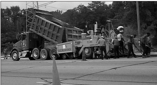
Summer street resurfacing has begun.

Please use caution as you travel in the areas that are under construction. We appreciate your patience as we strive to maintain Auburn's roadways in a good condition and improve our transportation network.