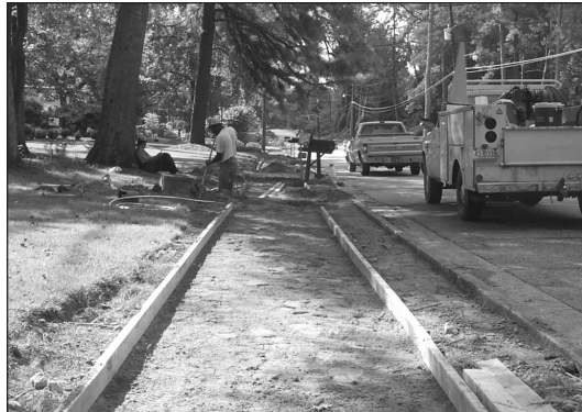
The new sidewalk on South Gay Street is underway.