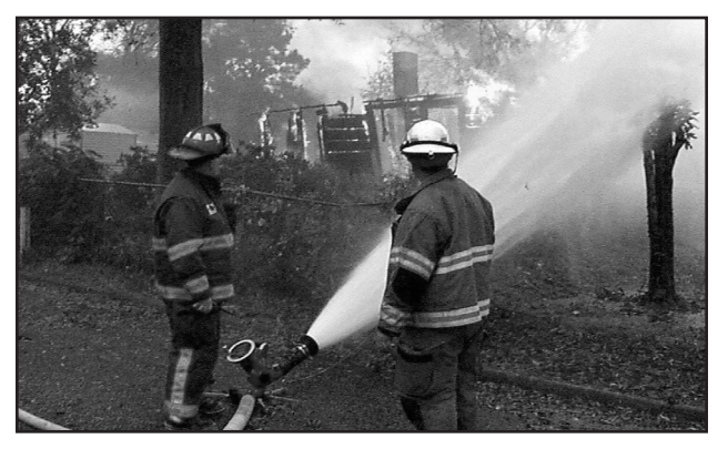
The regional training approach allows improved fire training in East Alabama.

The Regional Training Consortium is an on-going program and significant savings have been realized. This regional program has helped Auburn and other member cities defray the cost of fire training and development.