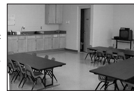
Boykin Community Center Addition

groups in the Center to better utilize their space. Auburn Day Care and Joyland Day Care are expanding their childcare programs by moving into six of the classrooms. In addition, the project has funded the installation of a fiber-optic cable network that will allow the Boys and Girls Club of Greater Lee County to use one of the rooms as a computer lab. Children will have the opportunity to learn computer skills and gain access to the Internet. This facility continues to be enhanced to meet the needs of citizens by providing important educational and quality of life services to many Auburn residents.