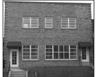
City Hall Annex

houses the development-related service functions of the City. The hours of operation for these services is 7:30 a.m. until 4:30 p.m. The Water Board Revenue office drive-through remains open until 5:00 p.m.