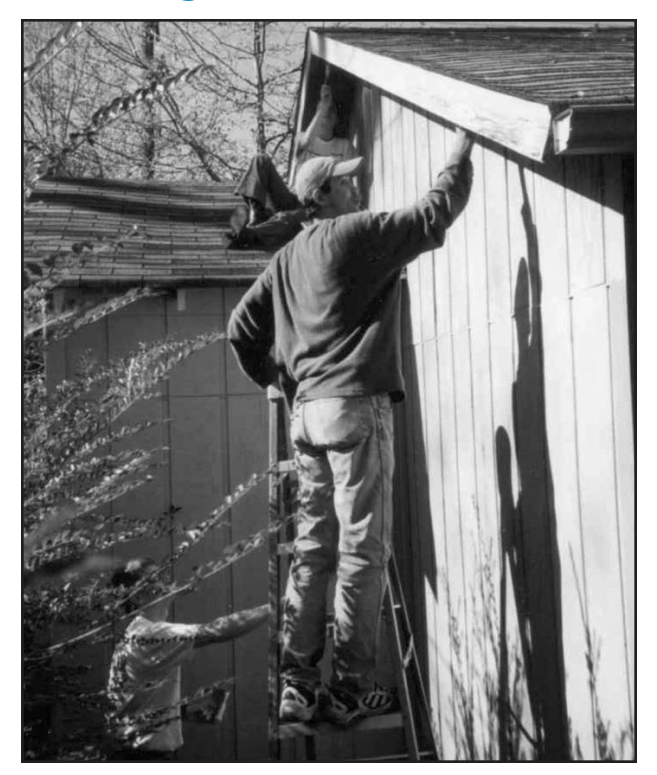
Volunteers can assist those in need through the Helping Hands program.

The public should expect STOP AHEAD signs to be posted a few weeks in advance of the installation of the four-way stop and the presence of Police at the intersection. For further information, please contact the Public Works Department at 501-3000.