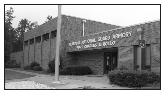
The National Guard Armory is the new voting location for residents of Ward 1. Place 2.

Any registered and qualified voter unable to vote at the polls on election day may apply for an absentee ballot if any of the following criteria are met: (1) the voter will be out of the county or the state on election day; (2) the voter has a physical illness, infirmity, or handicap that prevents his or her attendance at the polls, whether he or she is in or out of the