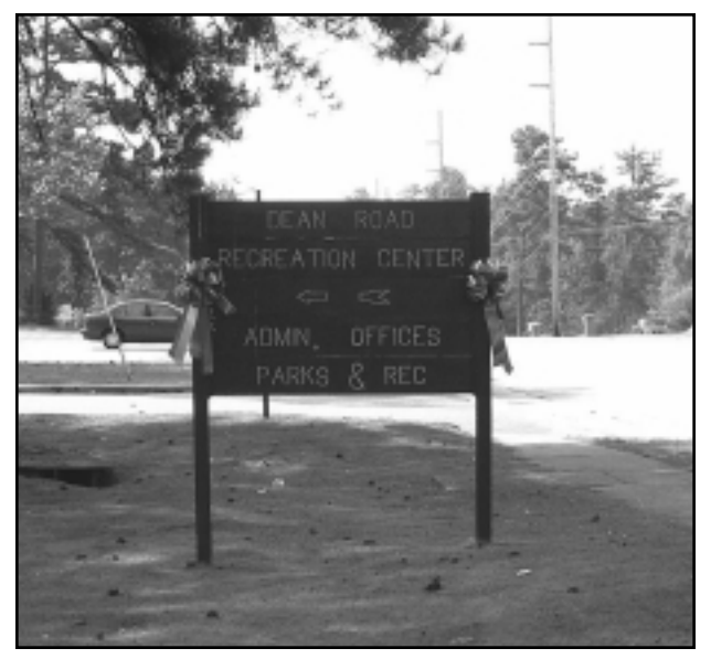
In recognition of the one-year anniversary of September 11, 2001, the City of Auburn placed red, white, and blue bows at City Facilities