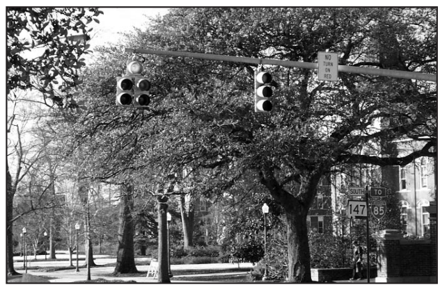
More energy efficient LED lamps will be installed in all City traffic lights.