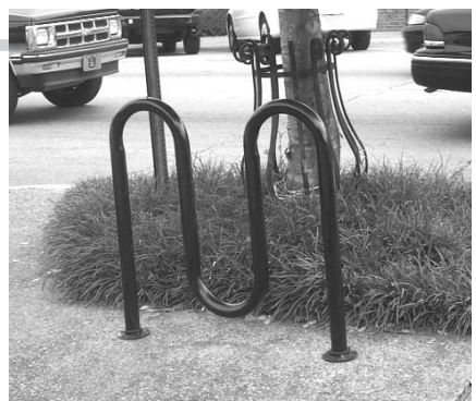
Bike racks have been installed throughout the downtown area.

For a number of years, the City of Auburn has taken steps to become more bicycle friendly. In 1998, the City Council formed a Bicycle Committee to develop a Bike Plan for the City of Auburn. The Plan, adopted as part of Auburn 2020, calls for the addition of bike lanes and bike paths throughout the City. Since that time, improvements have been made to the City's bike network and a number of projects are or will soon be underway. These bike-related improvements are helping to reduce traffic congestion, safeguard air quality, and make bicycling a safer and more enjoyable mode of transportation.