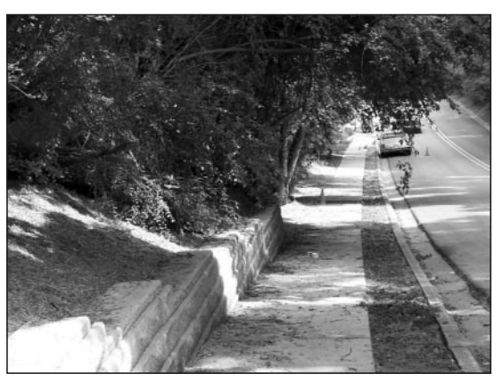
Installation of the Foster Street sidewalk was funded with CDBG money.

The City of Auburn was awarded over $800,000 in Community Development Block Grant (CDBG) funds from the U.S. Department of Housing and Urban Development (HUD) for the 2003 annual CDBG allocation. Auburn is one of thirteen cities in Alabama that is eligible to receive the CDBG funds directly from the federal government, and has received these allocations since 2000. HUD uses a formula to determine the funds provided to each eligible city that are specifically targeted to benefit low-and-moderate income residents.