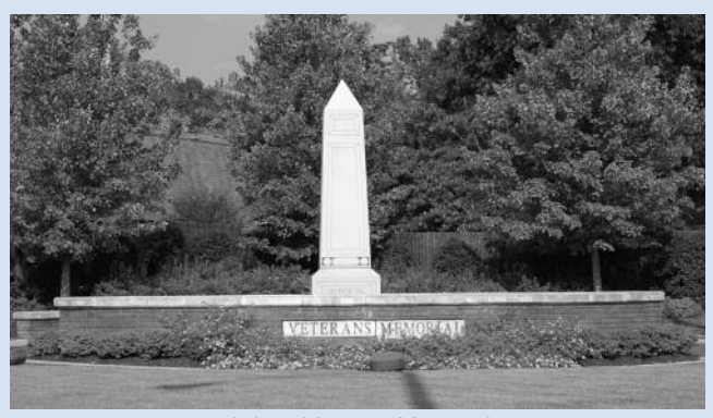
Auburn Veterans Memorial