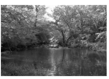
Phosphorus can make its Citizens can help Auburn's watershed by simply switching to phosphorus-free detergents.

Phosphorus can be found in everyday items such as lawn fertilizers, laundry detergents, and automatic dishwashing deter-While gents. it is an essential nutrient to plant growth, excessive amounts of phosphorus can have an adverse affect on water resources. through everyday household chores such as run-