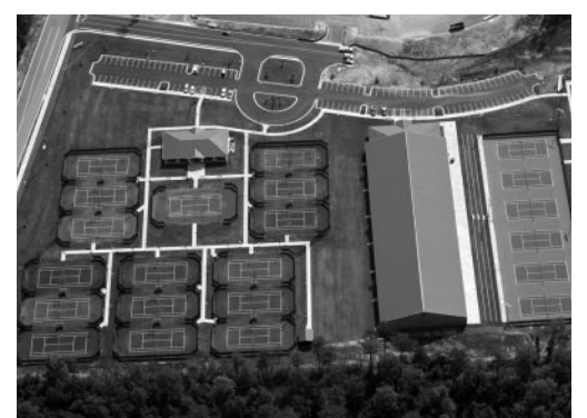
Yarbrough Tennis Center

It is striking that, even during a historic recession, Auburn citizens are happy with the value they receive for their tax dollar. Survey results show that (74%) of citizens are sat-