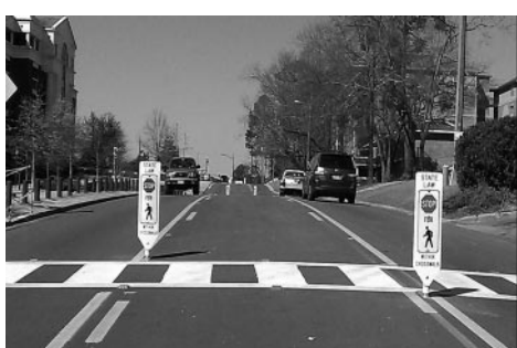
Infrastructure Improvements (above: Magnolia Avenue Safety Improvements; below: Wire Road Bridge Completion).